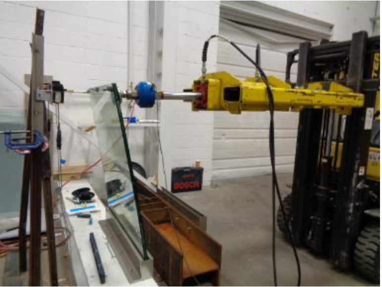
Photo No. 3 Concentrated Load Test at Top Corner of Glass Panel (Applied from Exterior Side)

Report No.: I0411.01-119-19-R0 Date: 03/19/18