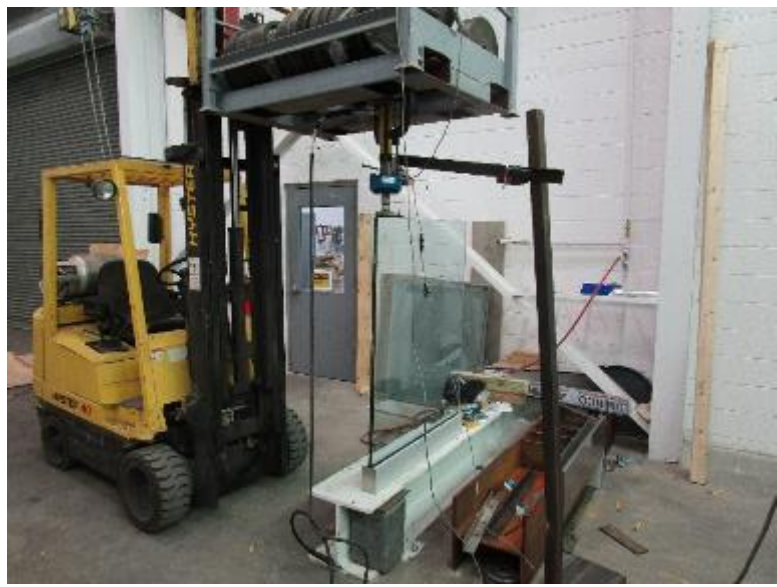
Photo No. 4 Concentrated Load Test at Top Corner of Glass Panel (Vertical)