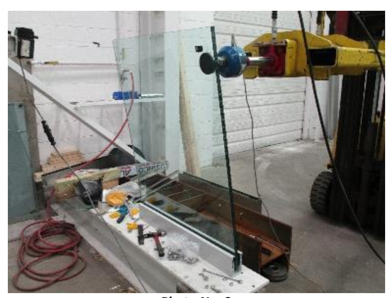
Photo No. 3 Concentrated Load Test at Top Corner of Glass Panel (Applied from Exterior Side)