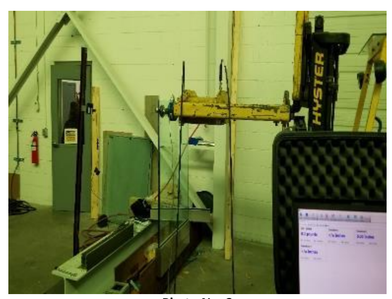
Photo No. 3 Concentrated Load Test at Top Corner of Glass Panel (Applied from Exterior Side)