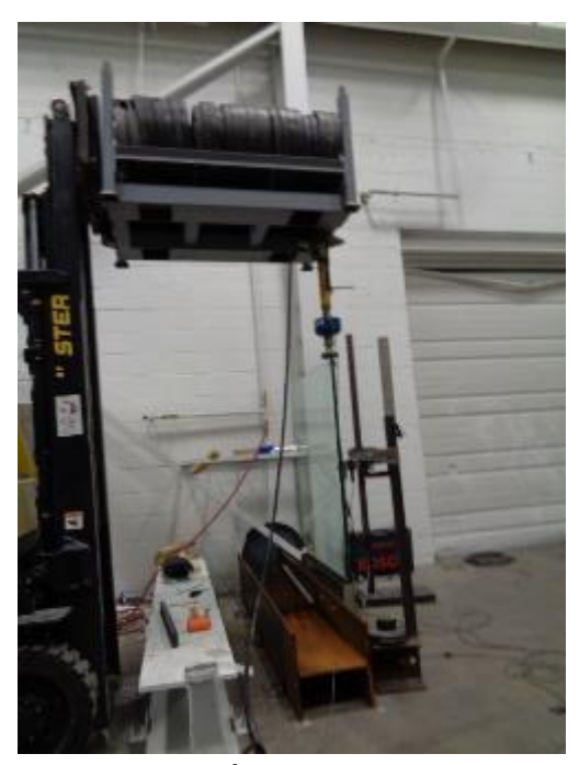
Photo No. 4 Concentrated Load Test at Top Corner of Glass Panel (Vertical)