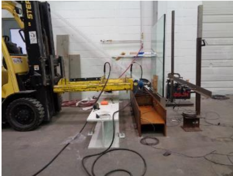
Photo No. 1 In-Fill Load Test at Bottom of Infill