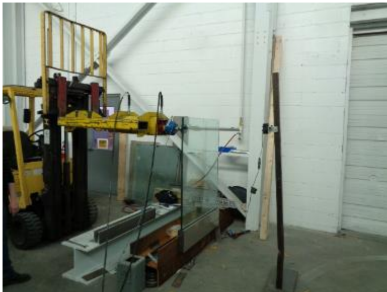
Photo No. 2 Concentrated Load at Top Corner of Glass Panel